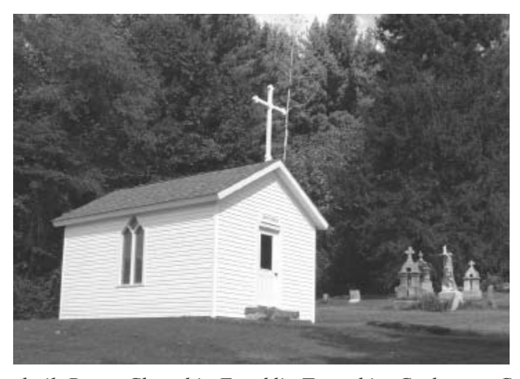
The rebuilt Royer Chapel in Franklin Township, Coshocton County