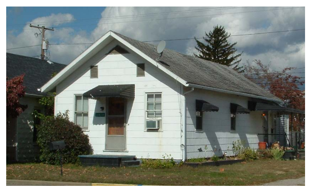
The former St. Anthony Church in Stockport, as it appeared in 2010