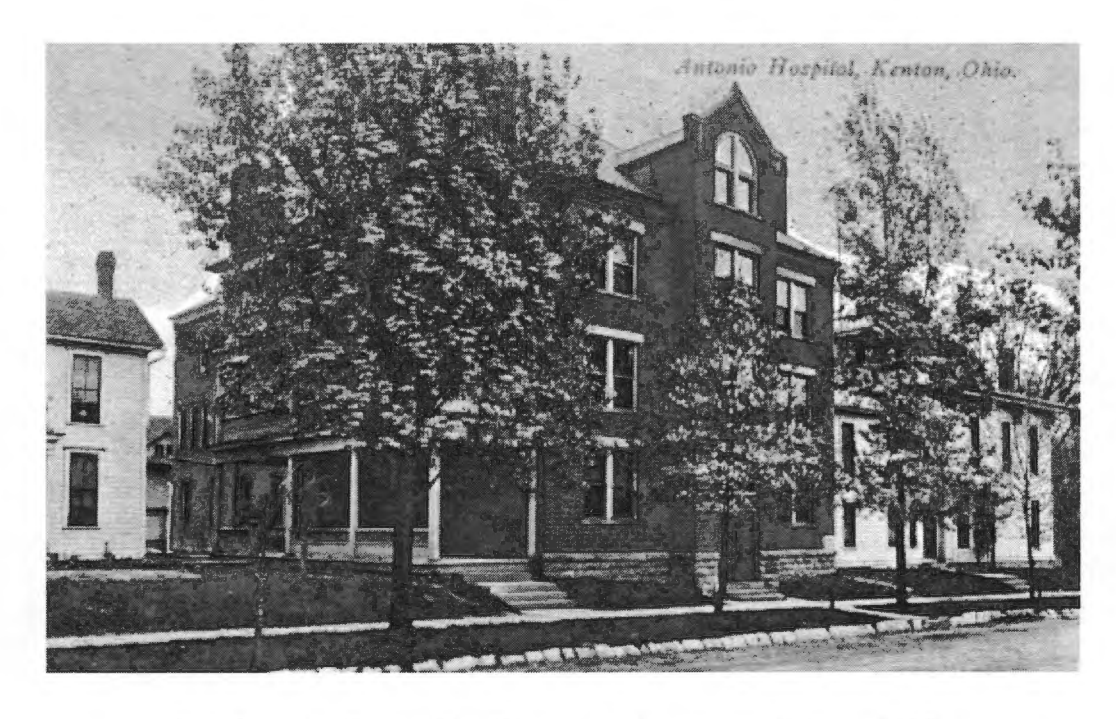
San Antonio Hospital in Kenton, as it appeared about 1910