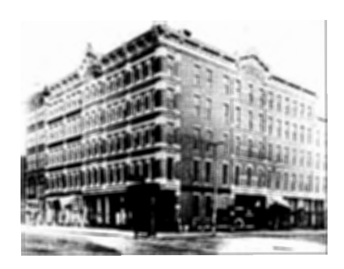
The Clinton Building