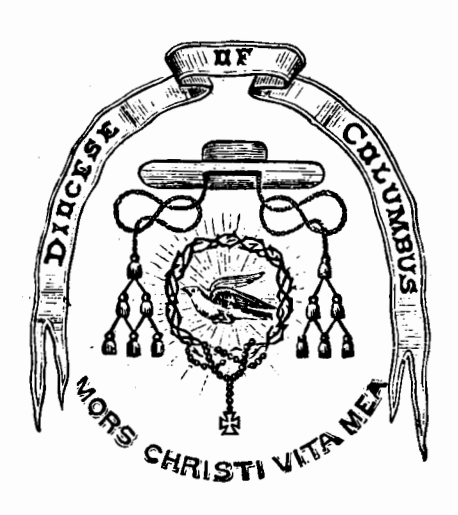
Seal of Bishop Rosecrans