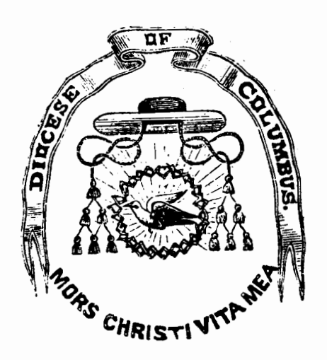
Seal of Bishop Watterson