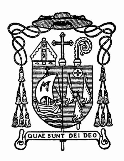
Seal of Bishop Ready