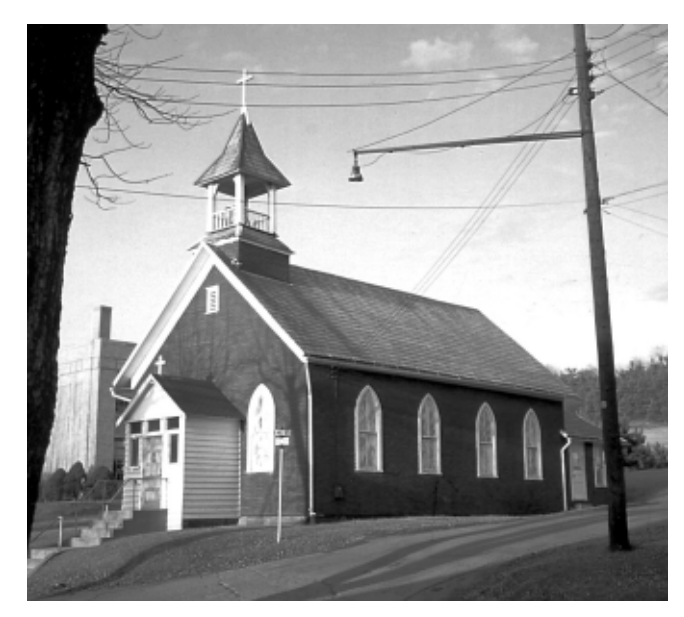
St. Patrick Church at its second location, Hill and First, Mineral City.