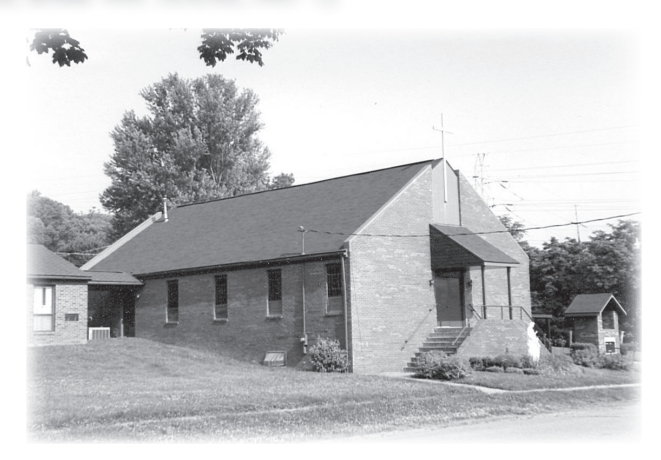
St. Ann Church in 2004, with a corner of the new parish hall

A small education and activities building, standing southwest of the church, was