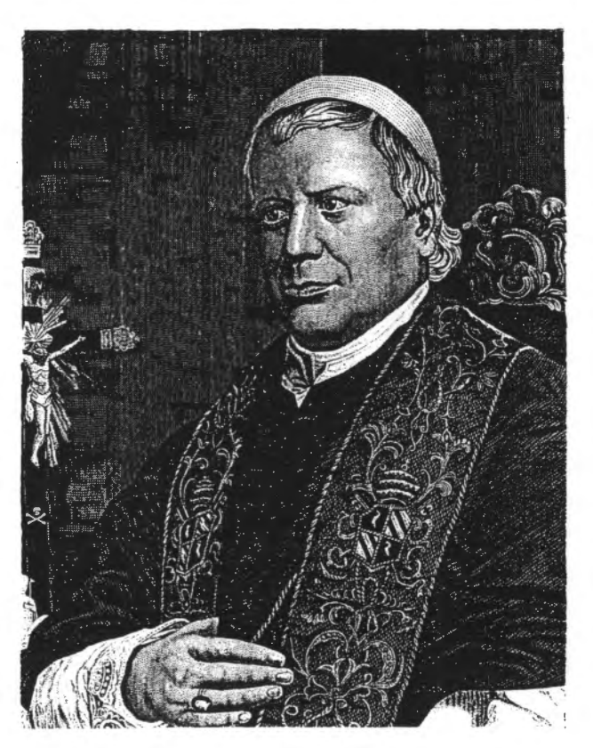
Pope Pius IX