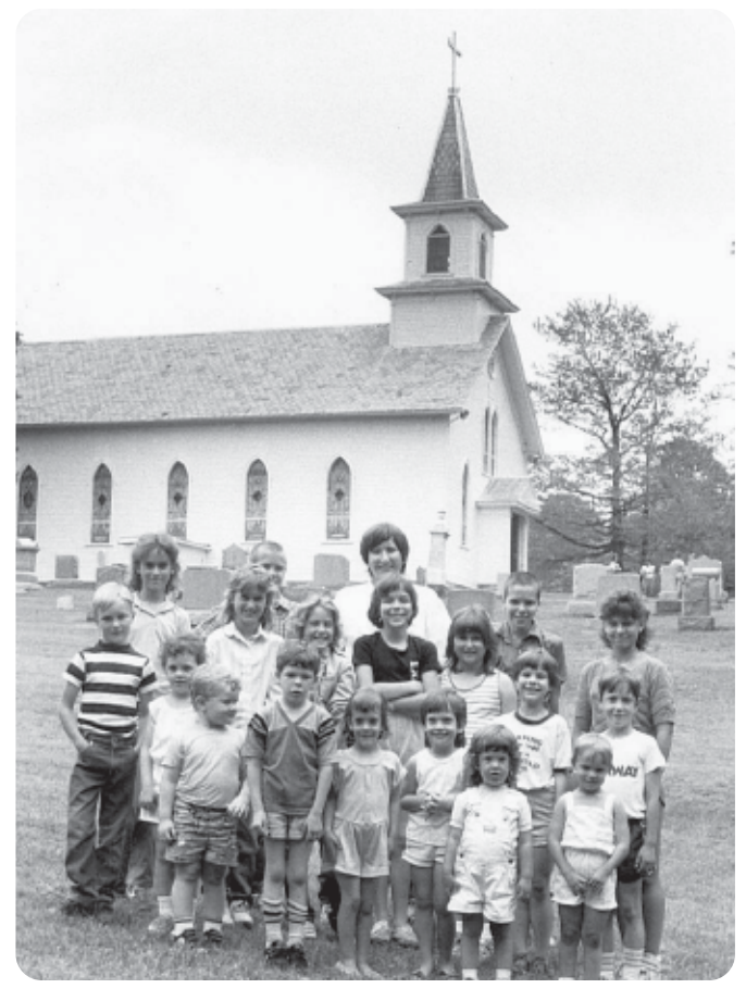
The religious education class at Wills Creek Our Lady of Lourdes, 1986