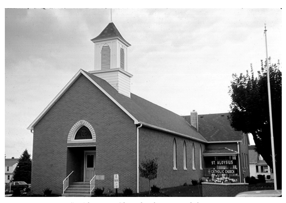
St. Aloysius Church after remodeling.