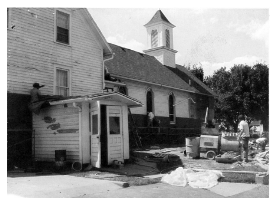
St. Aloysius Church during 1982 remodeling.