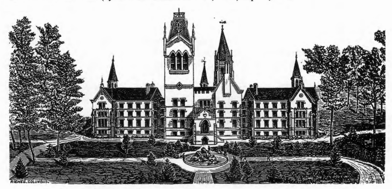
The Columbus State School, built in 1868 and rebuilt in 1881 after a fire, was razed in 1987.

Files of the St. Dymphna Guild Catholic Times, July 2, 1954 Columbus Dispatch, Feb. 11, 1957 and Feb. 17, 1959, Sept. 7, 1974