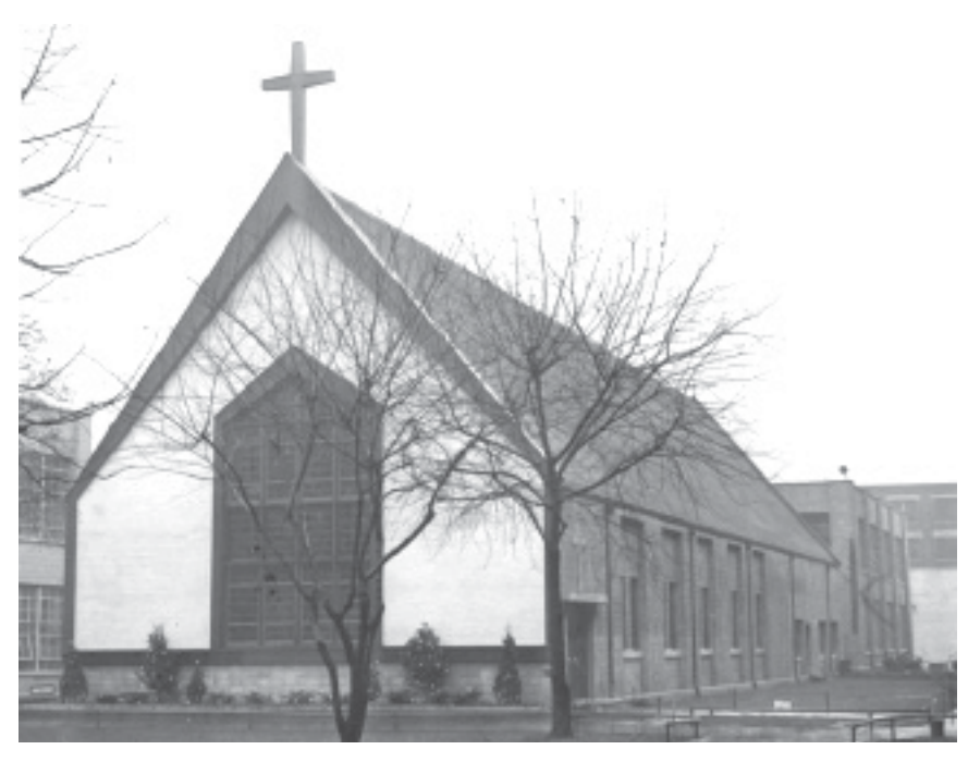
The 1955 St. Catherine of Siena Chapel

began to throw items at the police officers. The officers opened fire on the cellblocks, killing one prisoner and wounding four others. After this, the rioters quickly surrendered and peace was again restored to the prison.