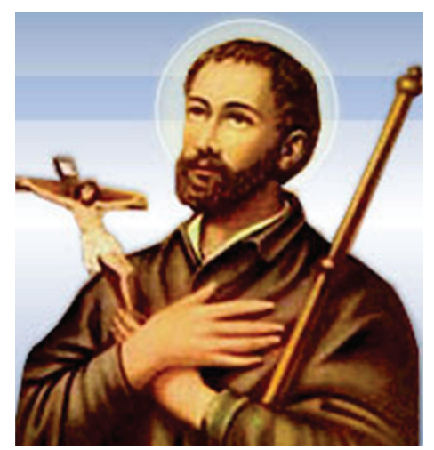
"In Thee, O Lord, have I put my hope. Let me never be confounded."

he could to obey Almighty God and help His people, body and soul. He evangelized people of India. He baptized thousands of them, taught them catechism of the Catholic Church, taught them all the basic prayers. Practiced with